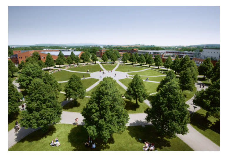
Our campus is the heart of the University. It is where friendships are made, collaboration is initiated, and ideas are conceived. It also features regular film screenings, art exhibitions, theatre performances, music performances, our annual "Uni Open Air" Festival, and much more.

Small and large projects, amounting to 8 and 15 credit points respectively, include both a practical component (e.g. an internship) and a theoretical component (e.g. seminars). Students are free to choose whether they divide the large project into a small project and a seminar. Ideally, it is chosen such that it can serve as the basis for your master's thesis, thus opening the third and final phase of your master's studies.