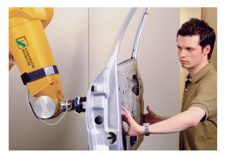
You can choose from the following topics: Software Engineering, Parallel and Distributed Systems, Robotics and Embedded Systems, Databases and Information Systems, Visual Computing, Algorithms and Data Structures, Theoretical Computer Science, and Human-Computer Interaction.